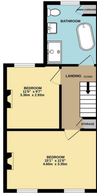
1ST FLOOR 427 sq.ft. (39.7 sq.m.) approx.